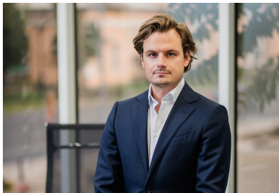
DN AGRAR Group Romania, No. 1, Iuliu Maniu, Alba-Iulia, Alba 510094, Romania